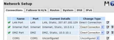
Enterprise-class networking services